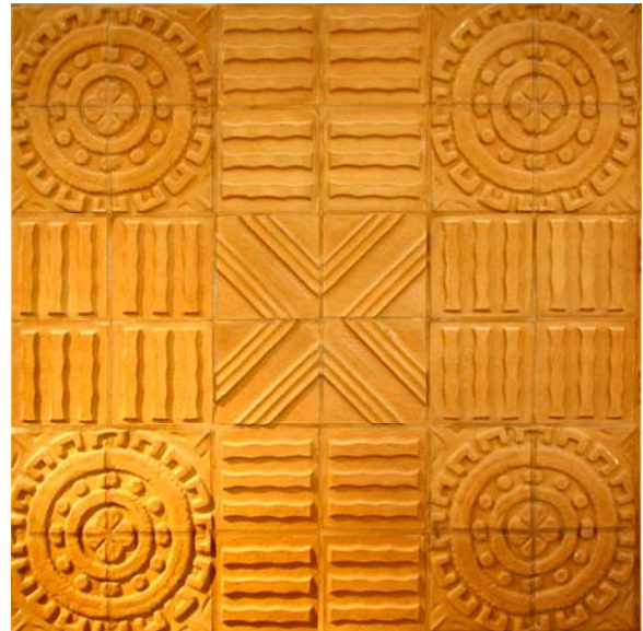
Calendar, Coliseum and Maltese

Aztec Series tiles have been manufactured by Cal-Ga-Crete since its earliest days in 1963. Inspired by ancient Mezzo-American and European designs these are 3-D tiles intentioned for vertical applications.