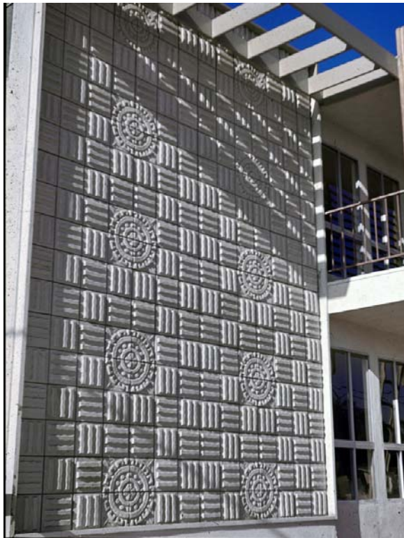
Calendar and Coliseum