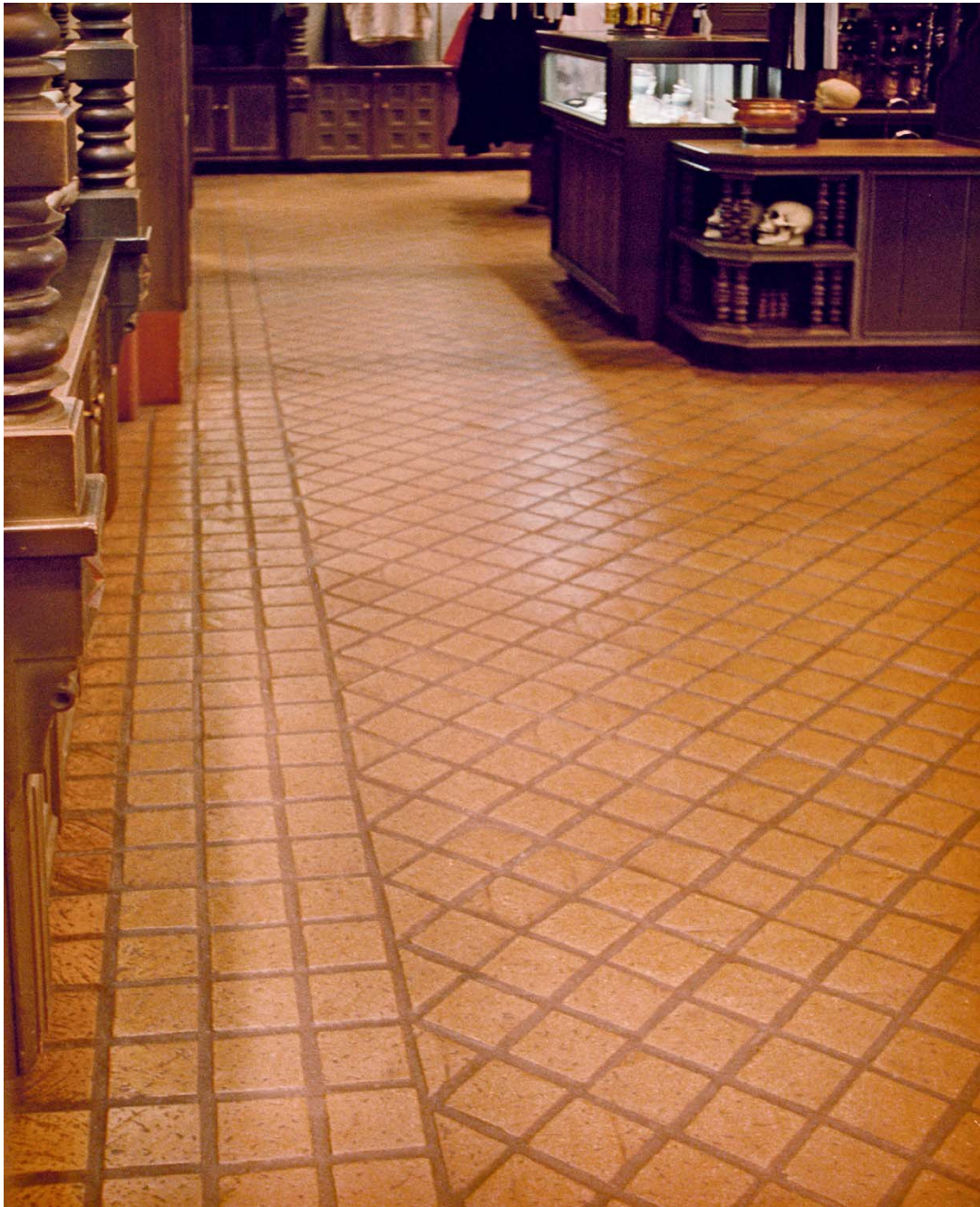
Brick Cobbles 12x12 (panel), custom color, Florida theme park.