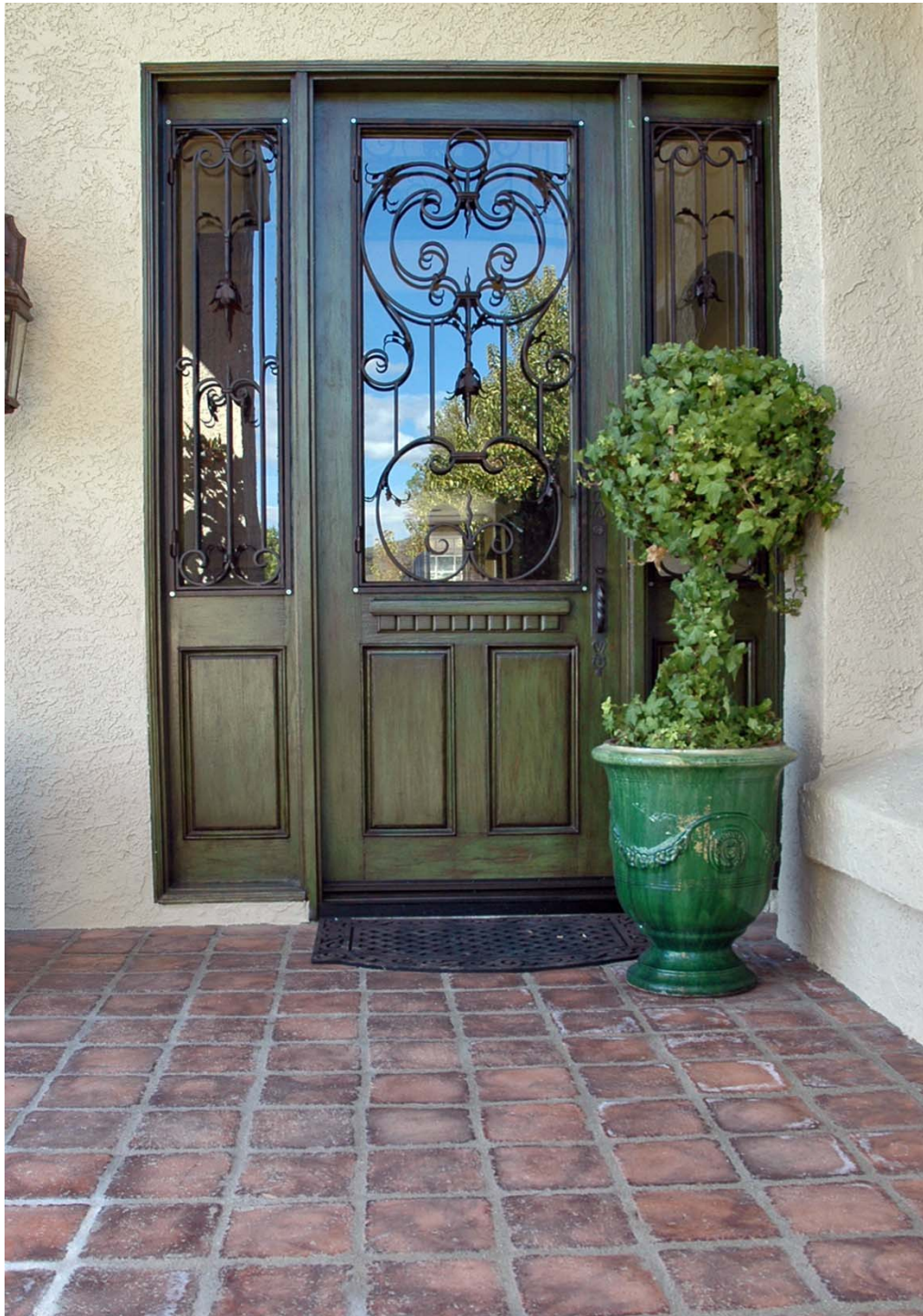
Burgundy 8x8, Café Viejo, Residential Entry, Agoura Hills CA