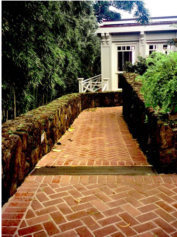
Residential Entry, Hawaii