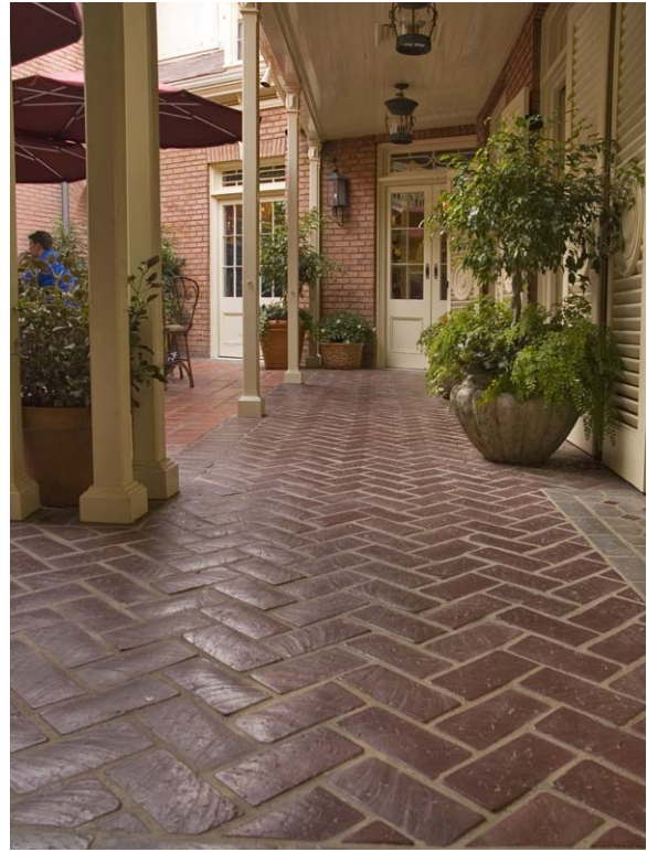
Theme Park, California