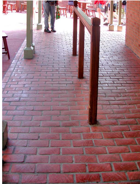
Theme Park, Florida

Brick Tile is one of the classic Cal-Ga-Crete products. They closely capture the essence of US standard wire cut 4" x 8" bricks. They can be ordered in a multitude of colors resembling many regional brick colors anywhere.