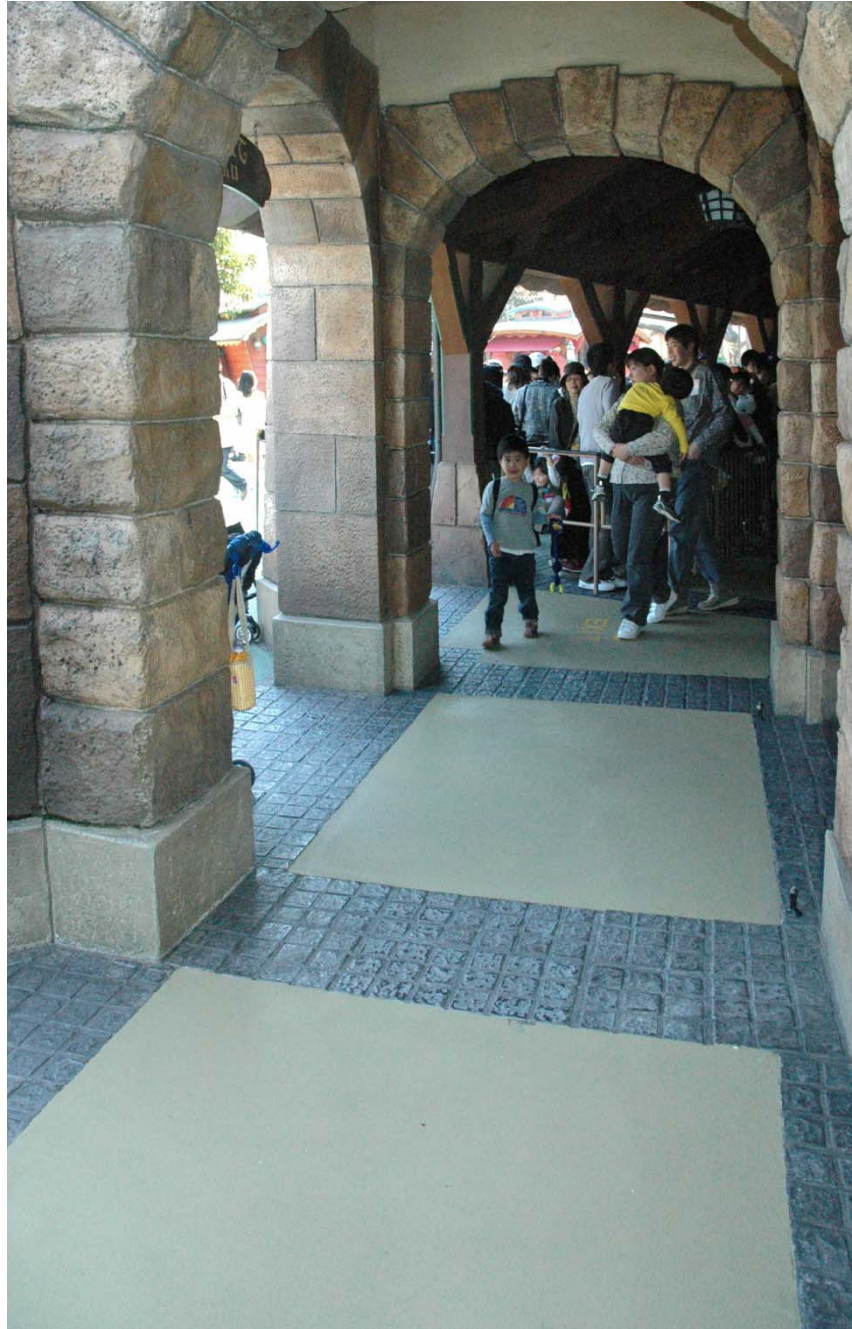
CobbleCrete 12x12 (panel), Granite Gray, Tokyo theme park.