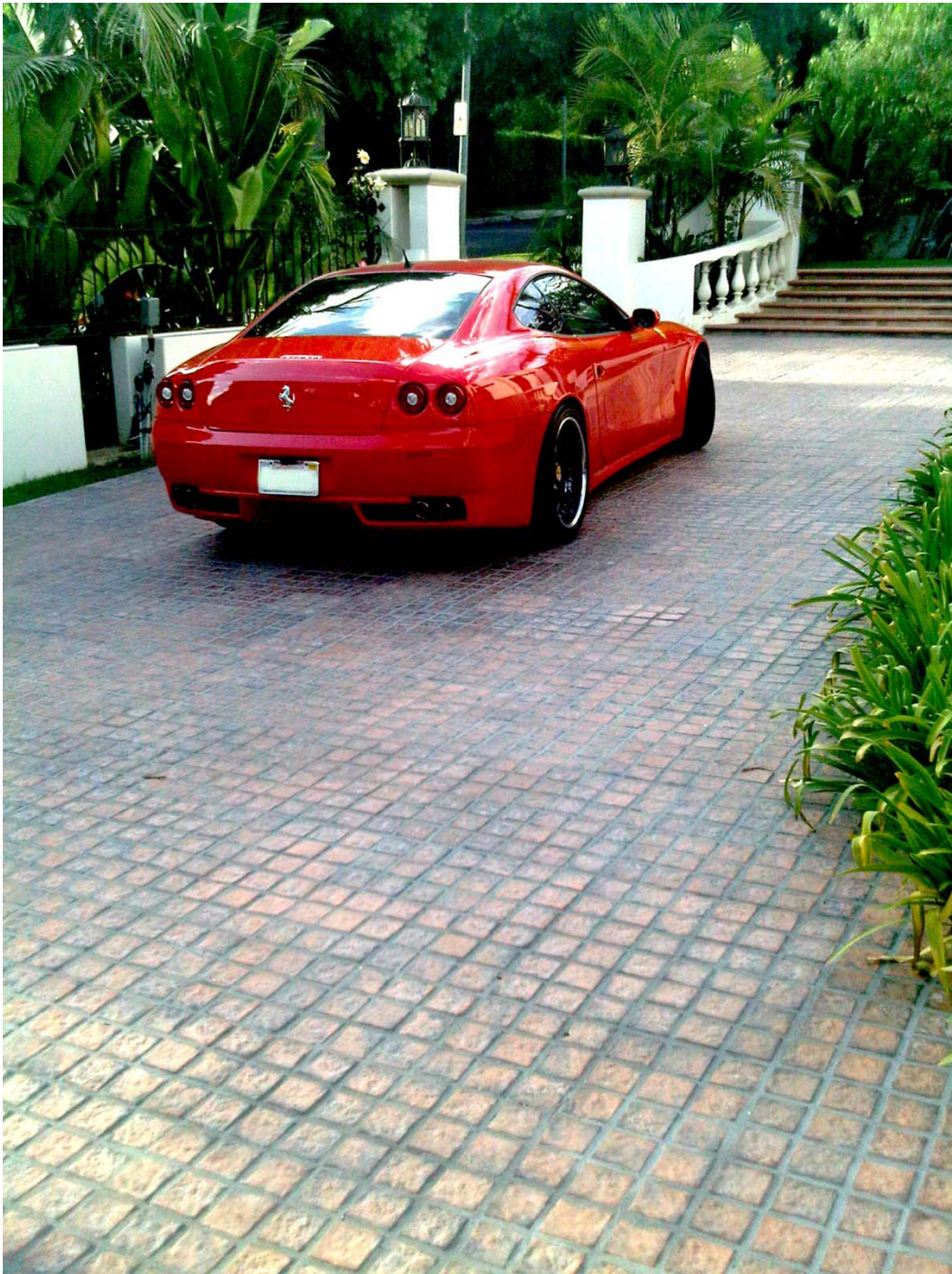
CobbleCrete 12x12 (panel), Mexican Terracotta, Beverly Hills, California