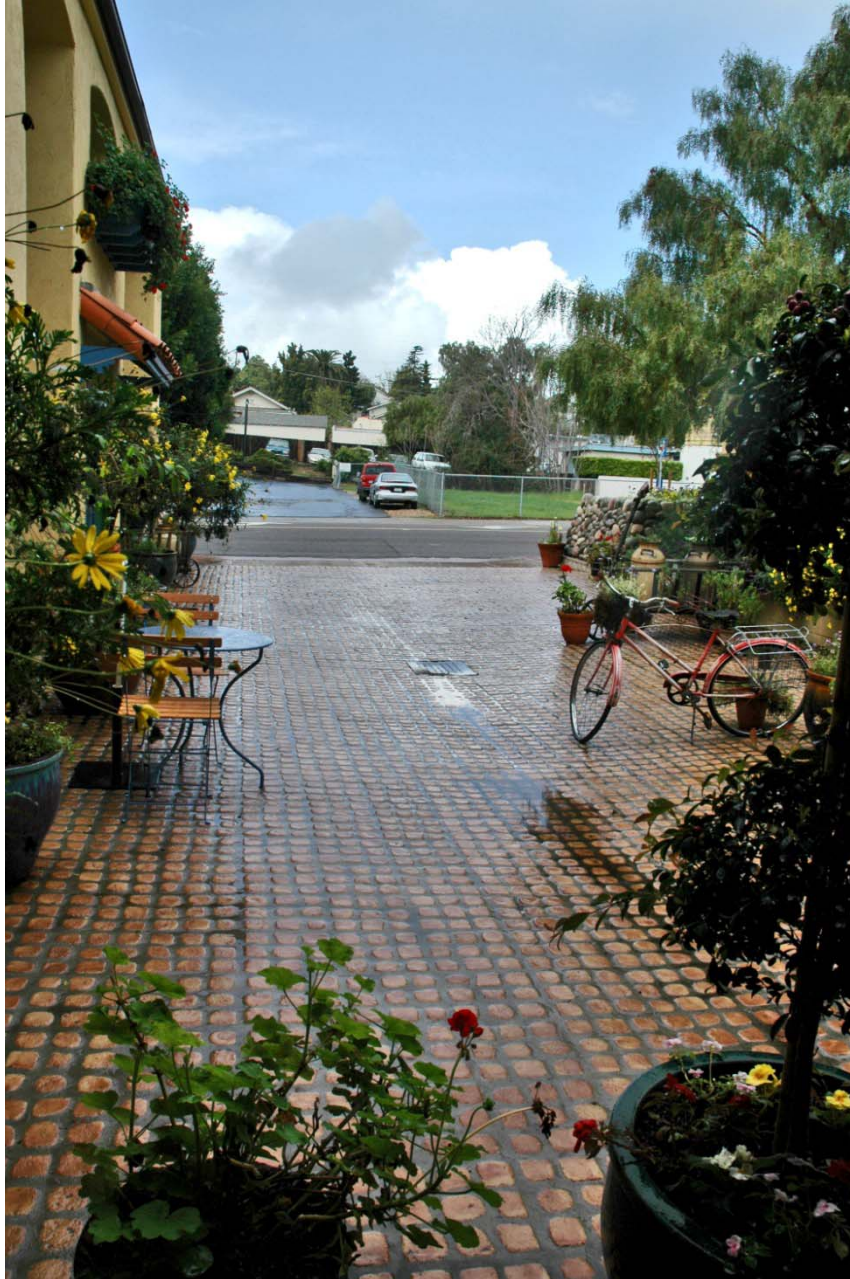
CobbleStone 12x12 (panel), Tan, California Central Coast hotel.