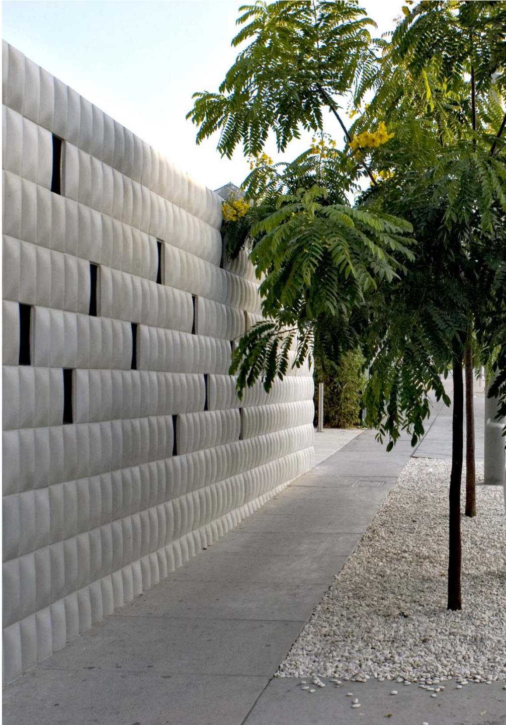
Convex Tile 6x12, Aspen color, Garment Showroom, West Hollywood CA