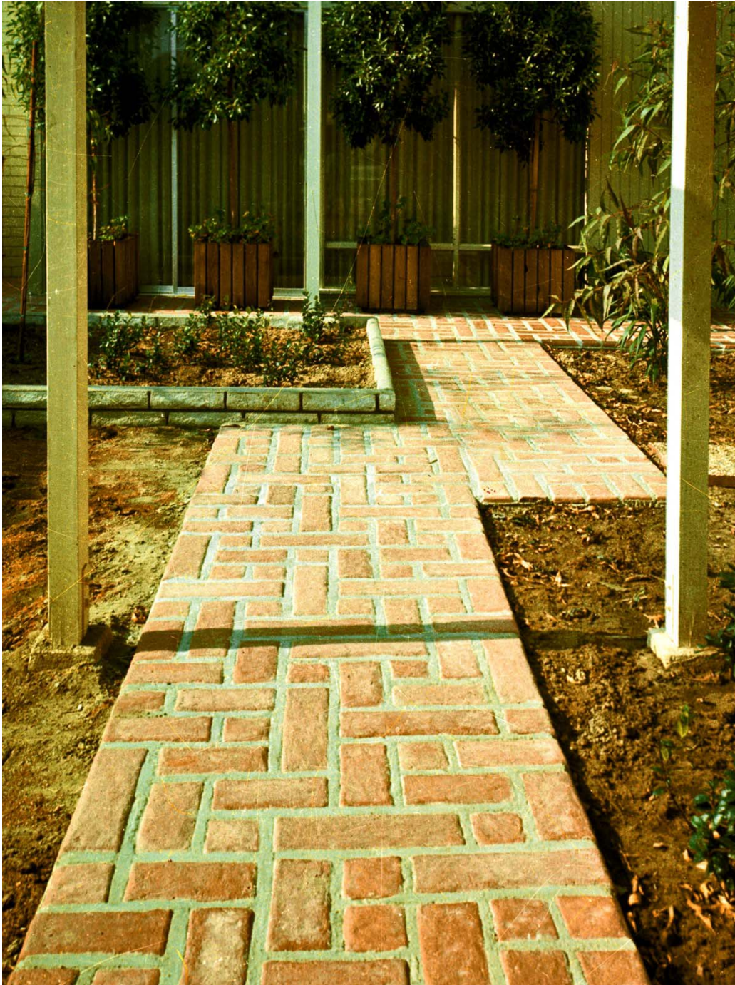
EuropaCrete, 6x6, 6x12 and 6x18, Terracotta, Residential Walkway.