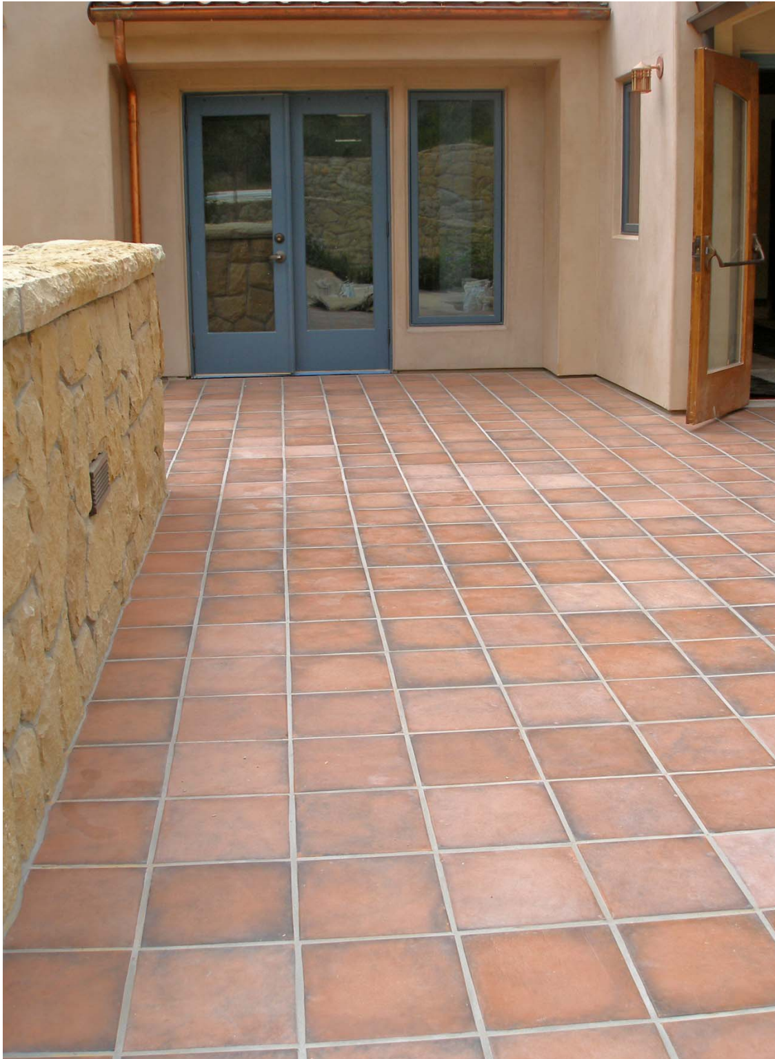
Orange Peel Eased Edge 12"x12" Mexican Terracotta, hospice facility, Santa Barbara, CA