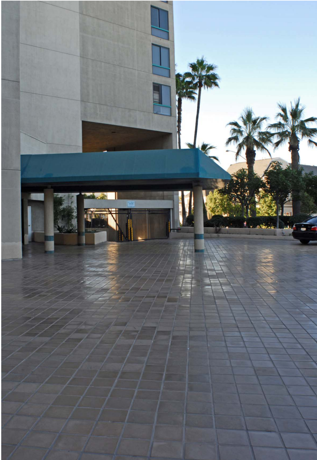
Orange Peel Top 8x8 Custom Buckskin, Condominium Driveway, Long Beach, CA