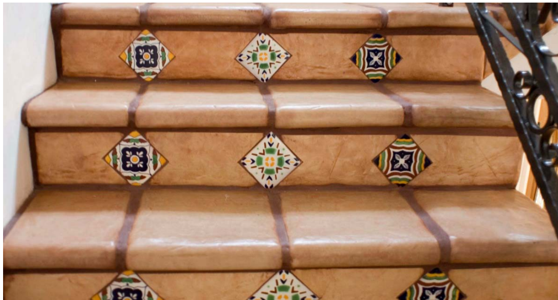
PadreCrete Stair Coping 12x12 Saltillo color, Interior Stair Case