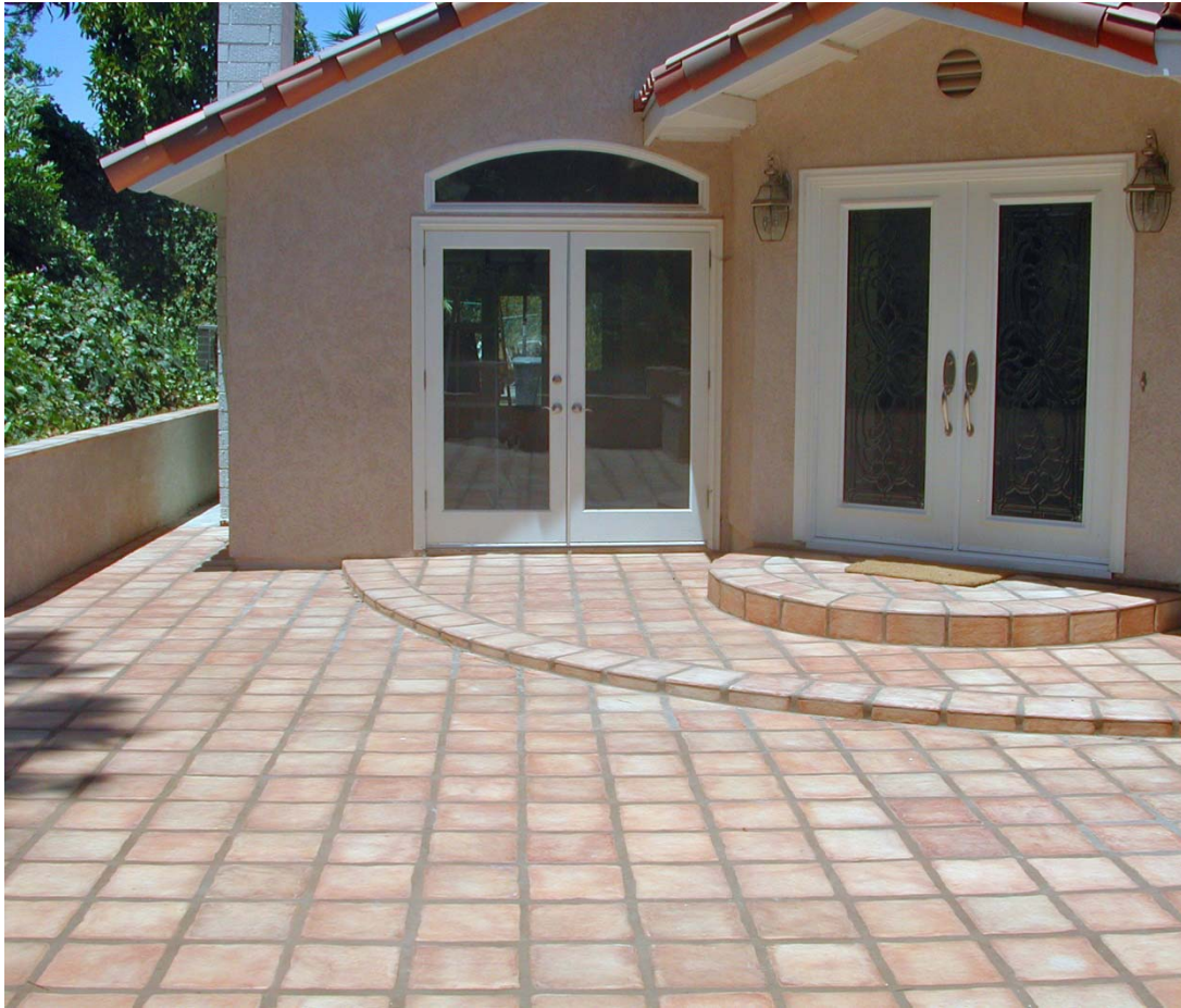
PadreCrete 12x12 Saltillo color, Residential Patio, San Pedro, CA