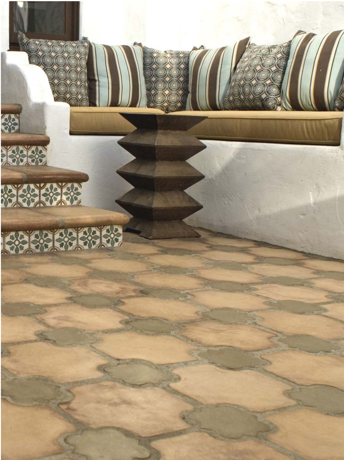
QuariCrete Santo Domingo, Spanish Terracotta, with Moss colored Dot, Patio, Redondo Beach, CA