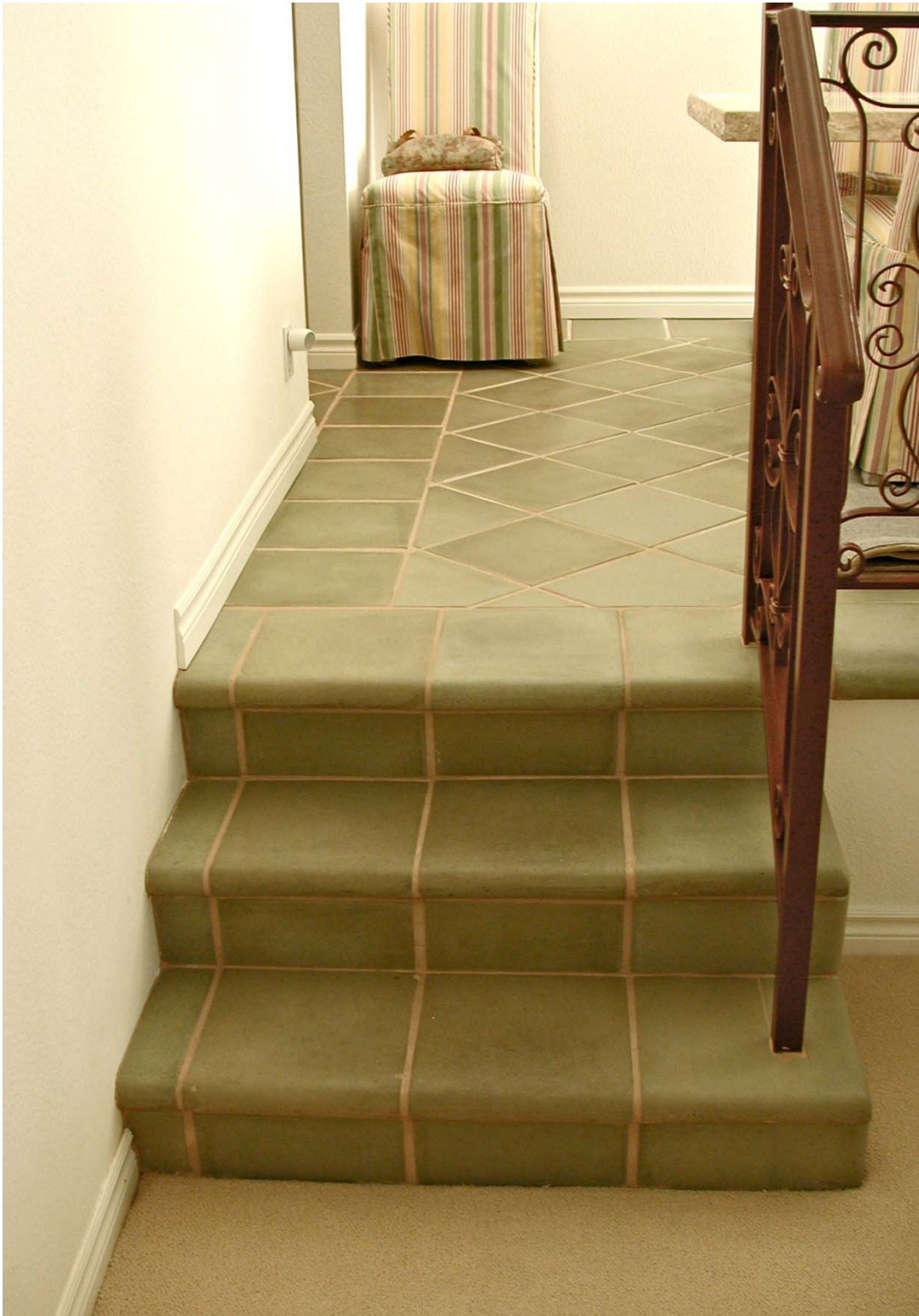
QuariCrete 12x12 Moss color with Stair Coping, Residence, Brentwood, CA