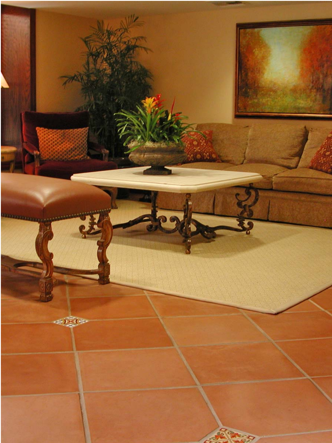
QuariCrete 18x18 Terracotta, Office Lobby, Los Angeles, CA