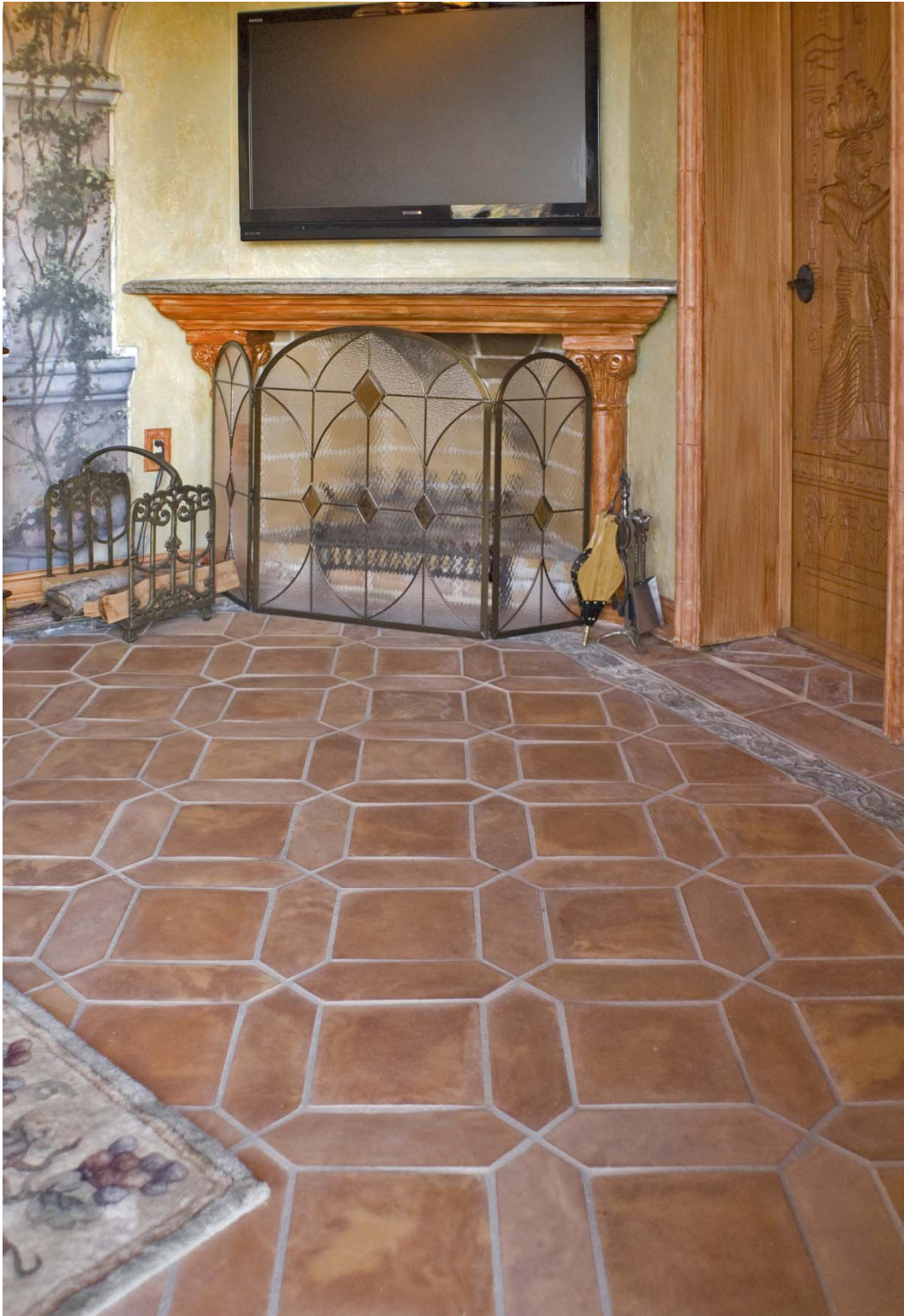
QuariCrete 4x12 Pickets with 8x8 Dot Antique French 3, Wine Room, Brentwood, CA