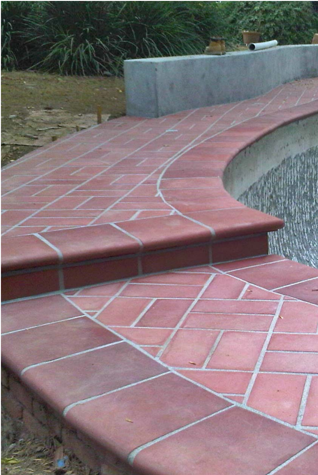
QuariCrete 6x12 Sedona Red color with Stair Coping, Residential Pool, Bel Air, CA