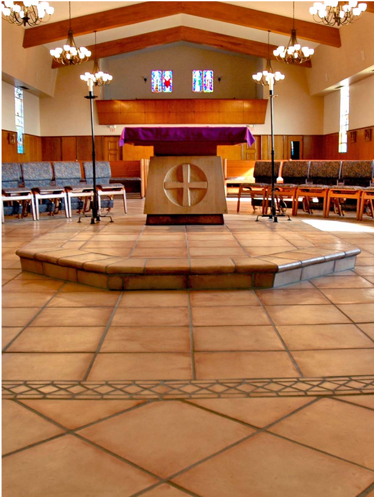
Saltillo 16x16, Saltillo color, Church, Burbank, CA