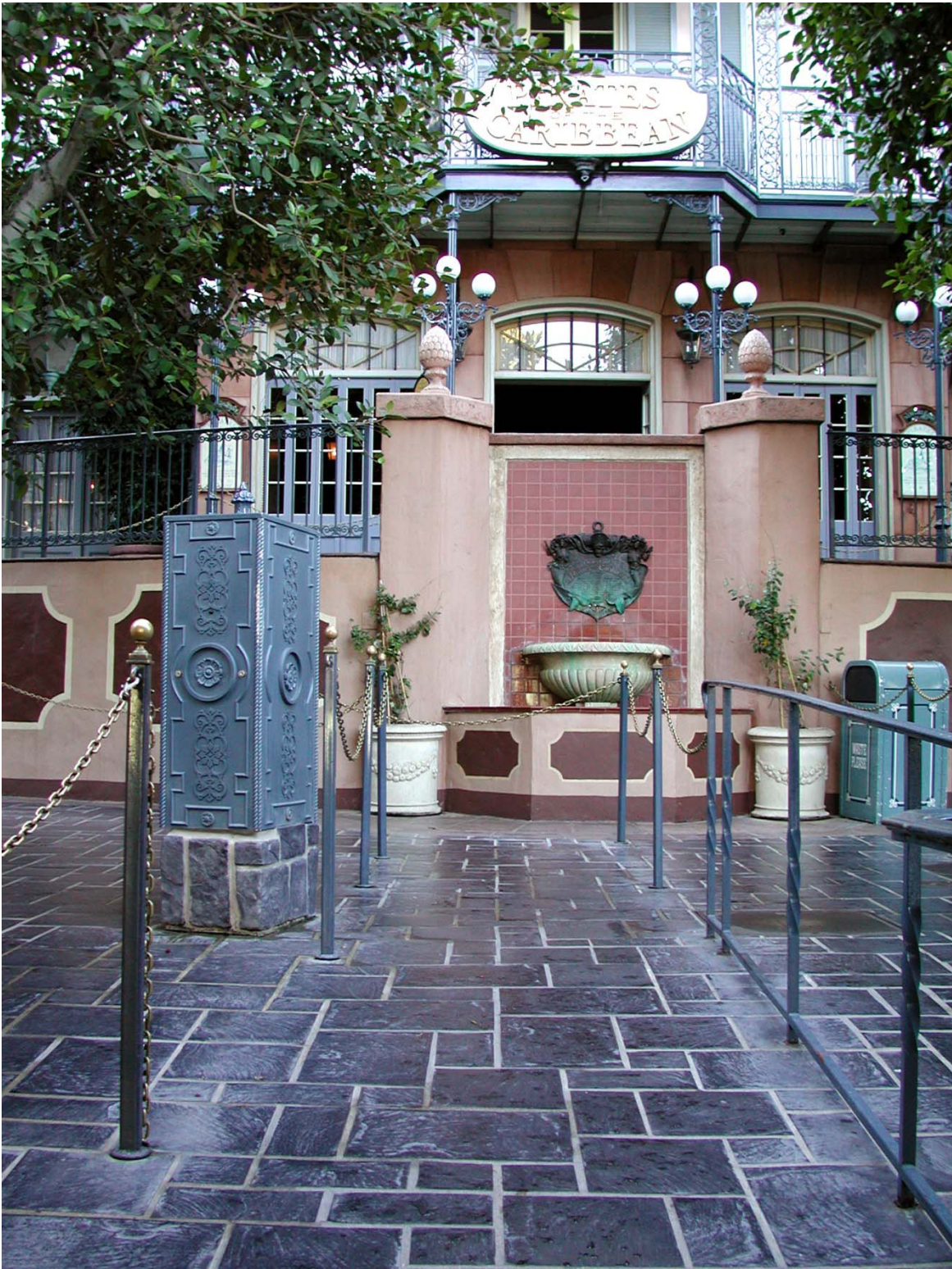
Slate 6x12, 12x12 and 12x18, Steel Gray, Theme Park, Southern California