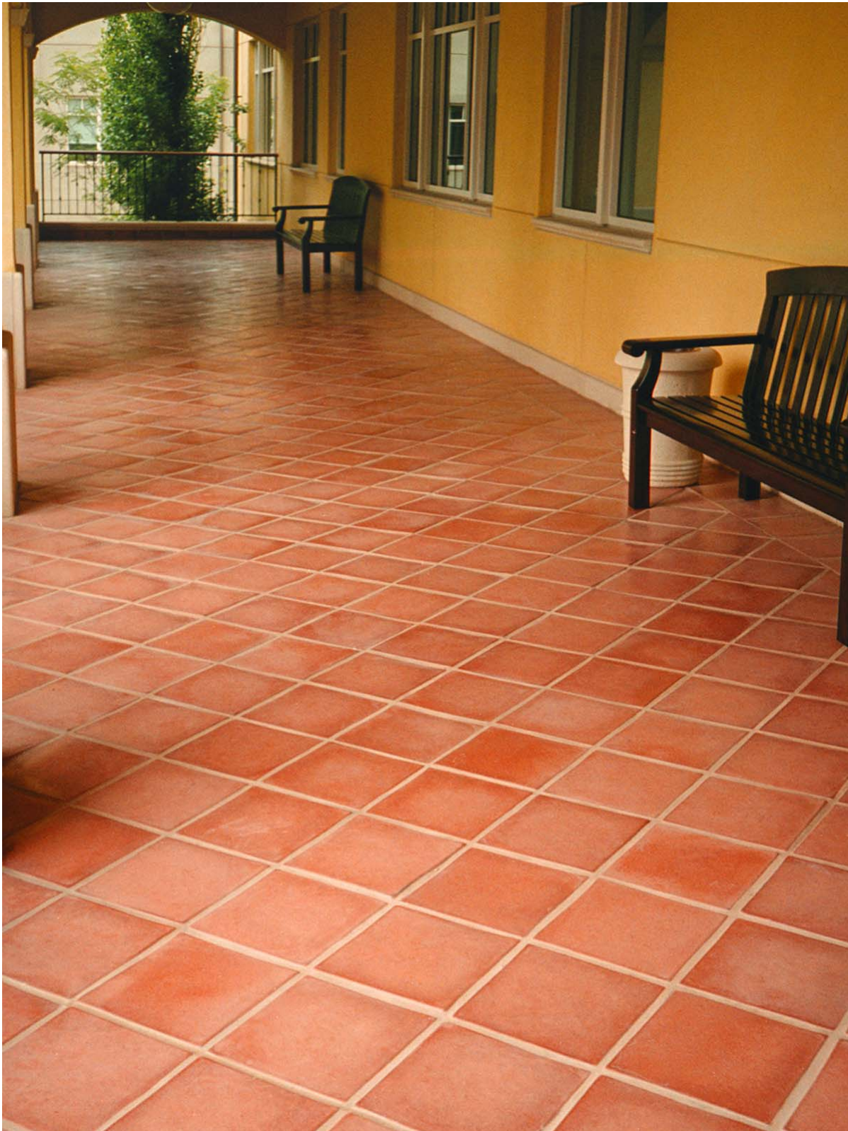
Super Saltillo 12x12, Red Terracotta, Studio Campus Colonnade, Glendale, CA