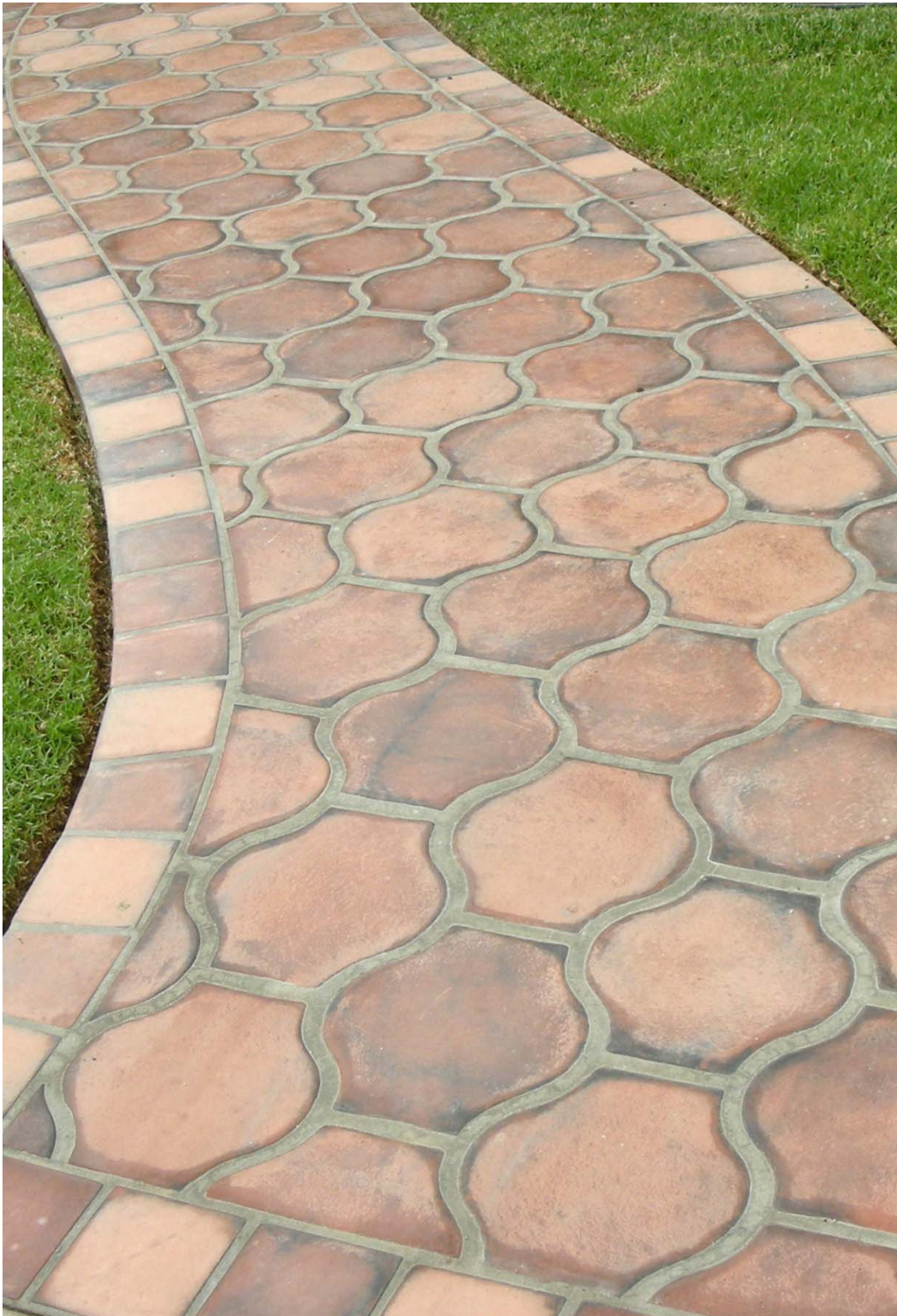
Super Saltillo Mexical 12x12, Mexican Terracotta, Residential Walkway, Long Beach, CA