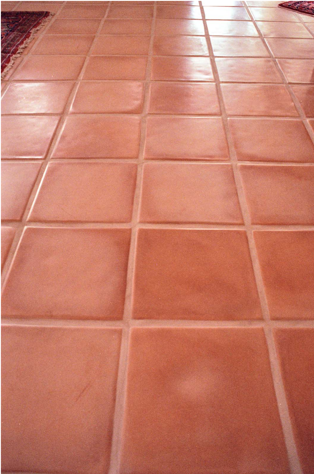
Super Saltillo 14x14, Custom Saltillo, Residence, Valley of the Moon, CA