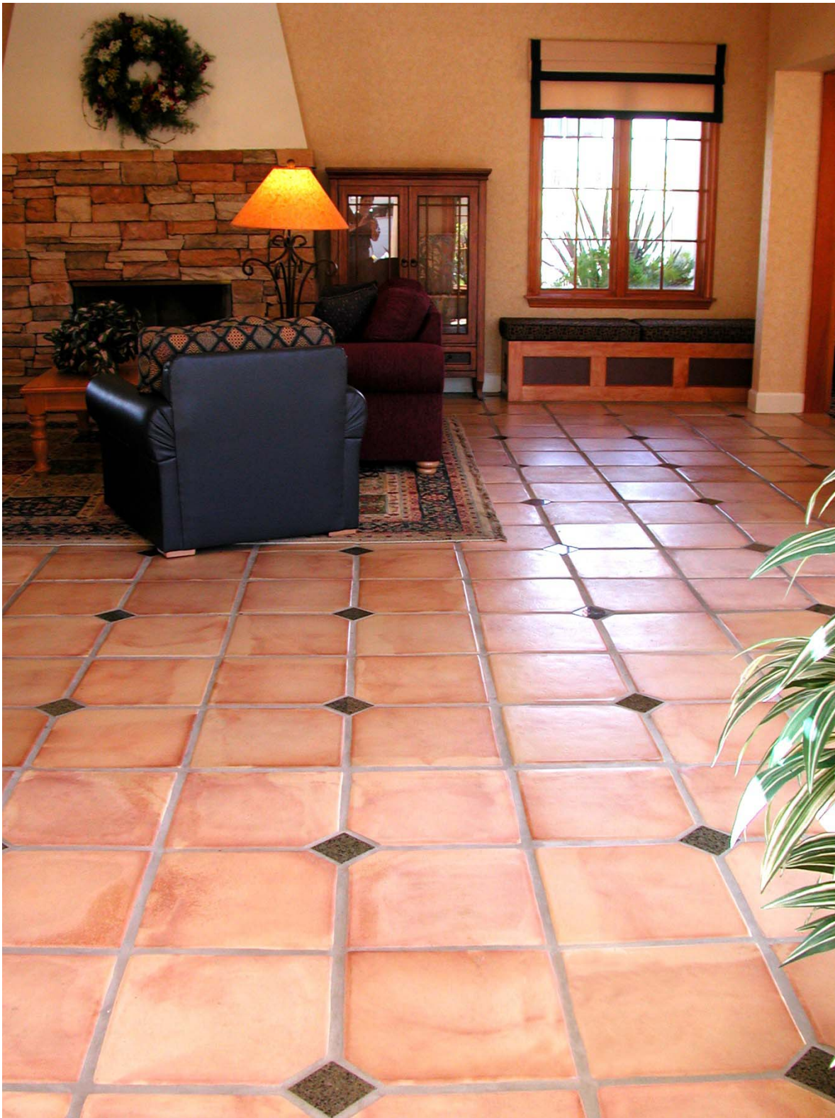
Super Saltillo 16x16, Saltillo color, Hotel Lobby, San Diego, CA