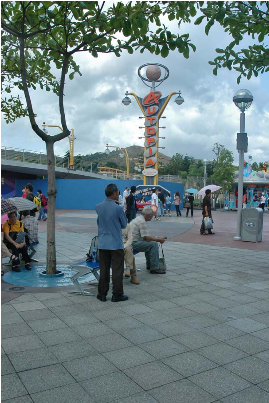
Smooth Top Eased Edge 16x16x3 sand set pavers, Heavy Sandblast, Hong Kong