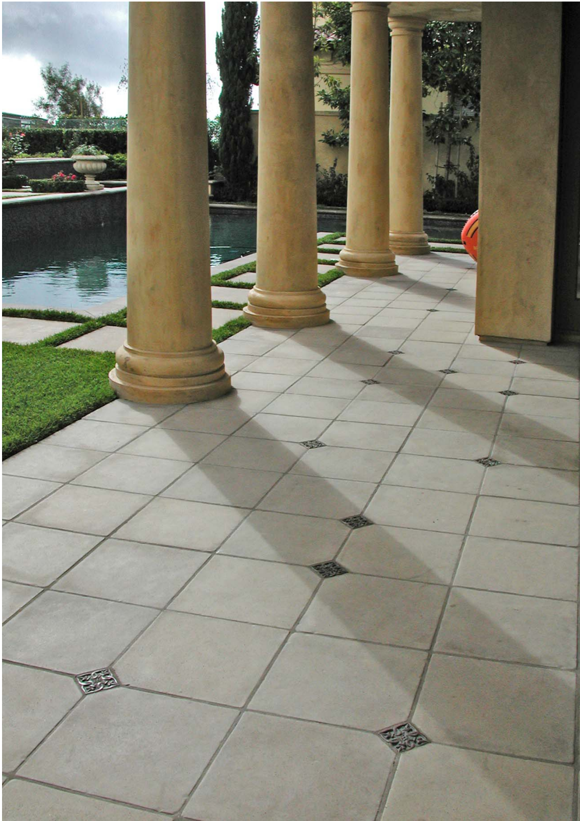
Smooth Top Square Edge 17x17, Light Sandblast, Buff, Residential Patio, Laguna Niguel, CA