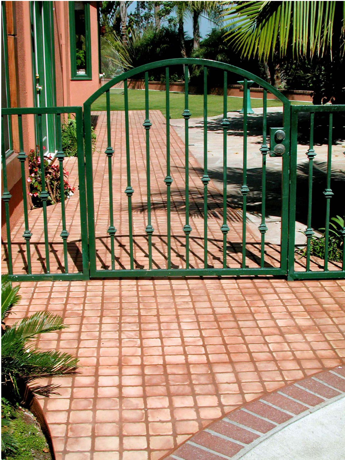
TumbleCrete (panel) 12x12, Saltillo color, California Residential walkway