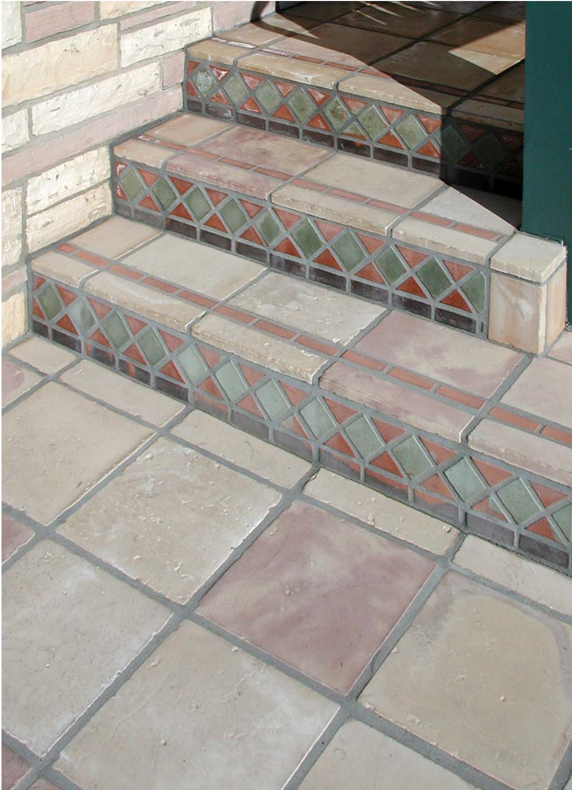
TumbleStone 12x12 (with Bar Tile), Custom Color, Hotel Walkway, Santa Barbara, CA