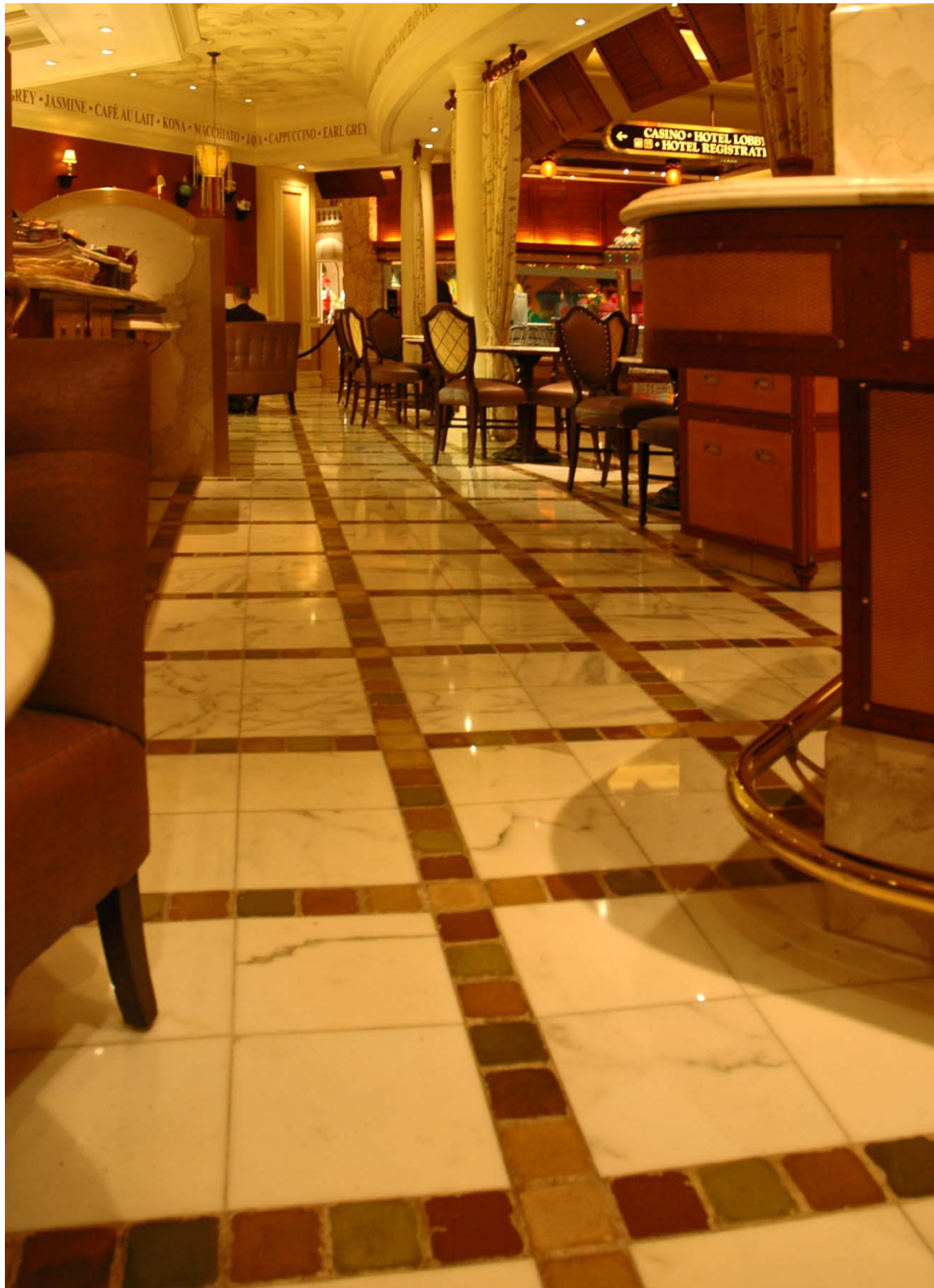
TumbleStone 4x4, Mixed Colors, Hotel Restaurant, Las Vegas, NV