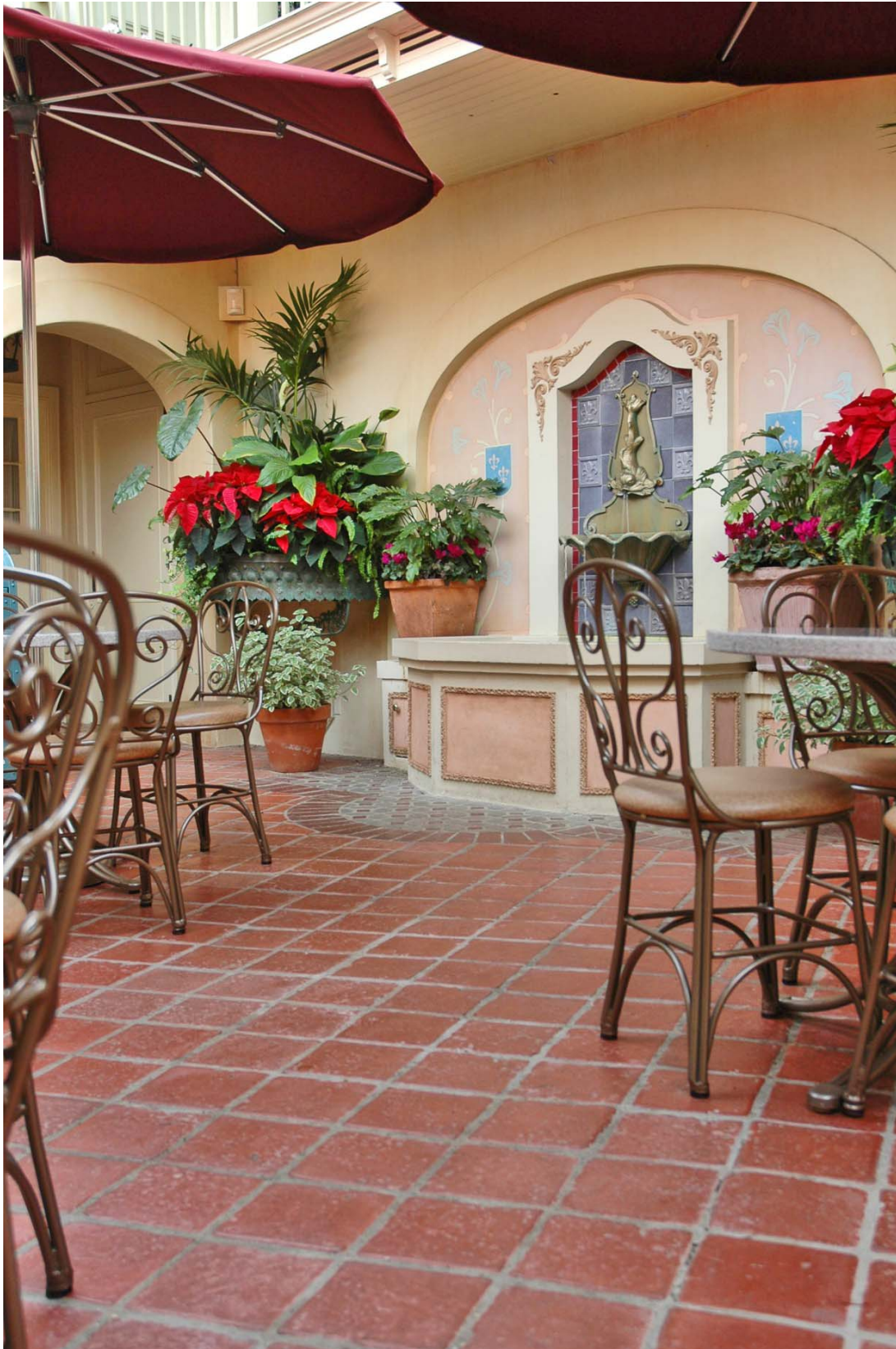
TumbleStone 8x8, Brick Red, Theme Park, Southern California