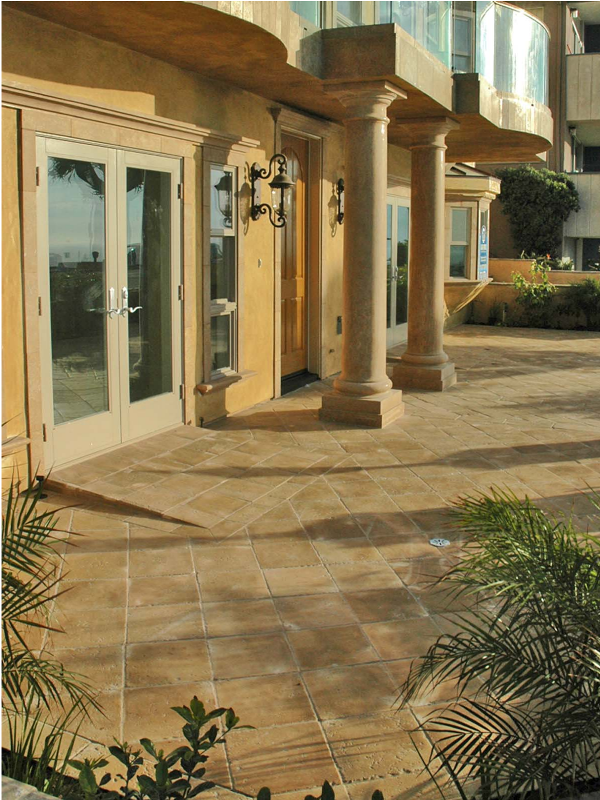
Tumbled Travertine 12x12, Custom Color, Condominium, Redondo Beach, CA